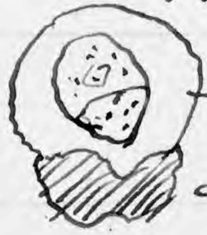
They're intine swollen by water extine stripped

A peculiarity which distinguishes the pollen grain of Coniferae from that of Angiosperms lies in the rupture and final stripping off of the cuticularized extine by the swelling of its intine .